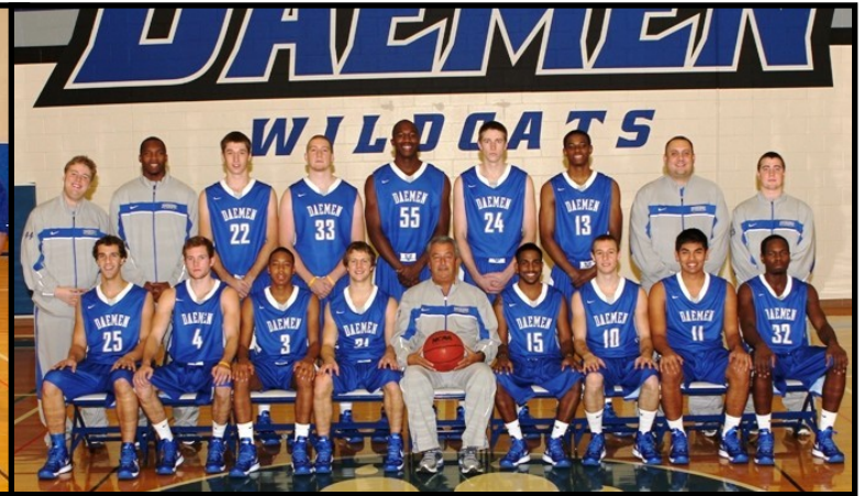
2012-13 Team: USCAA Runners Up