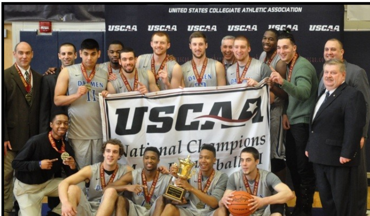
2014-15 Team: USCAA National Champs