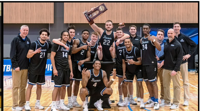
2020-21 Team: NCAA Div. II East Region Champs